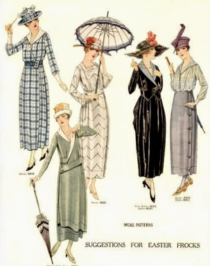
1918 Dress Styles