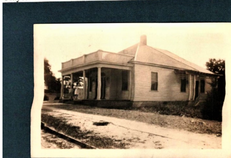
(Above) Original auxiliary building situated beside old Clayton High School to the right (now the Clayton Center). The building was moved to Church Street in 1928 and in 1929-30, remodeled using plans from renowned architect Douglas Ellington and became the home of "The Woman's Club of Clayton".