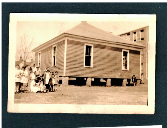
Original auxiliary building on old Clayton High School grounds, which was moved to Church Street in 1928 and in 1929-30 remodeled and became the home of "The Woman's Club of Clayton."

The flyer for the event is attached so that you may pass it on to those folks that you can invite. We appreciate everyone's participation in this club event!