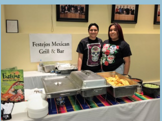
Festijos Mexican Grill & Bar