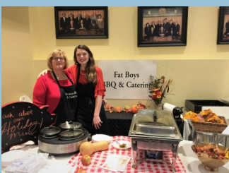
Fat Boys BBQ & Catering