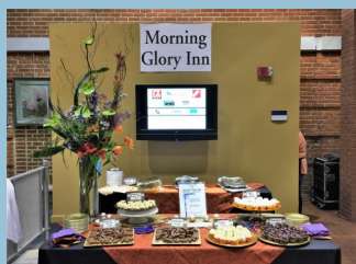
Morning Glory Inn